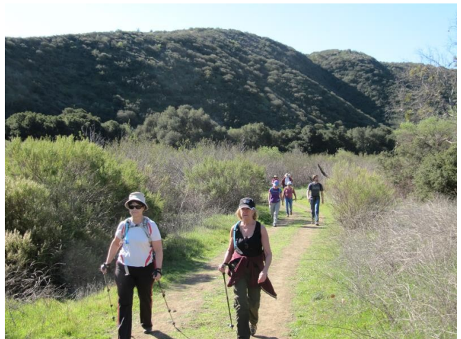
Hawk Canyon Trail North-west