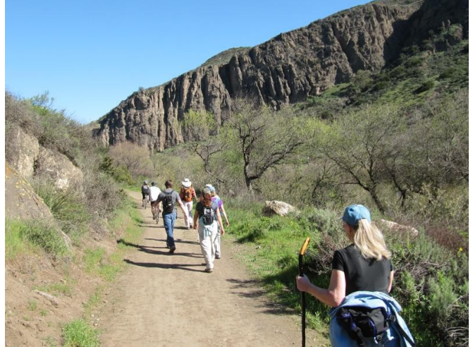
Hill Canyon Fire Road