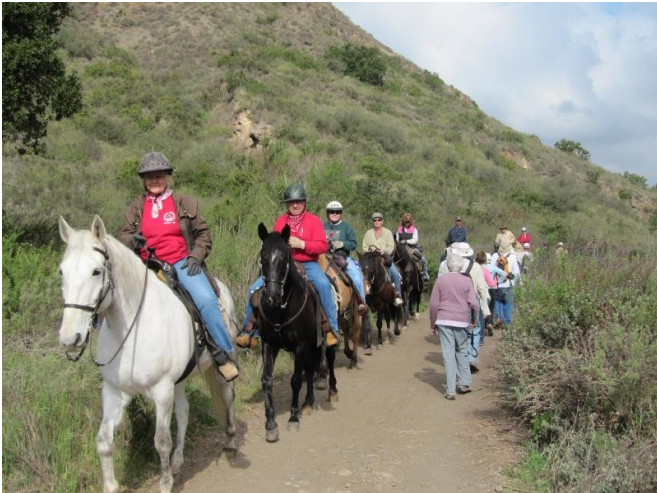
Lots of people use the Hill Canyon FR!