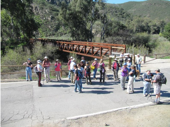
Hill Canyon FR starts with a bridge